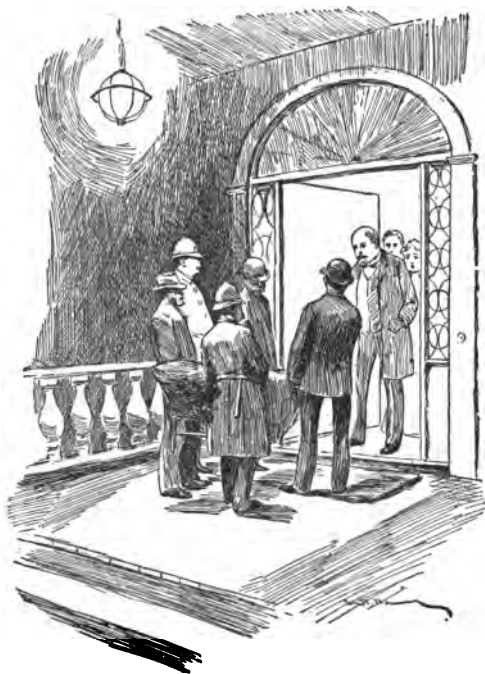
CLAUDE VERNON'S RETURN.